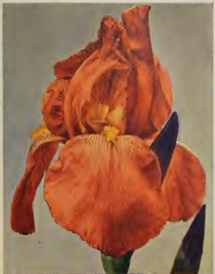
Bryce Canyon—$10.00 (Page 8)